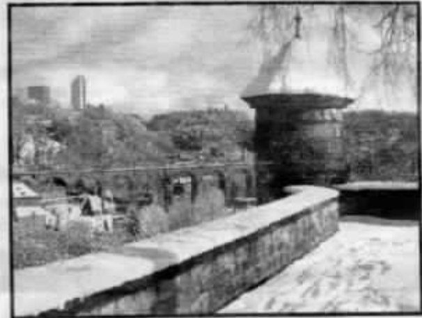
Luxembourg City Wall

Join us this summer as we march in the following parades. Contact Terry Sveine (507-354-1123 or tesss@newulmtel.net ) for information on when and where to assemble. At minimum, try and attend the parade and cheer us on!